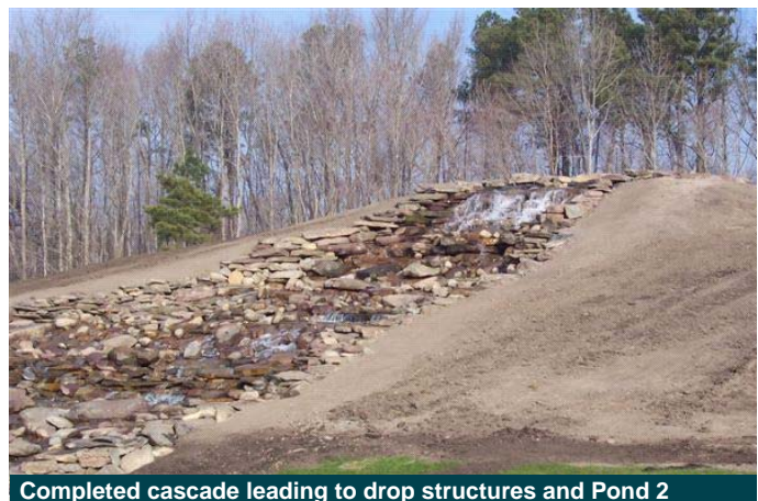
Completed cascade leading to drop structures and Pond 2