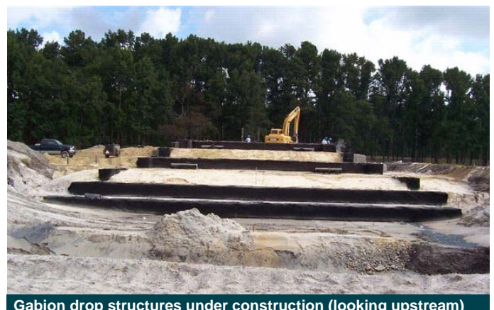
Gabion drop structures under construction (looking upstream)