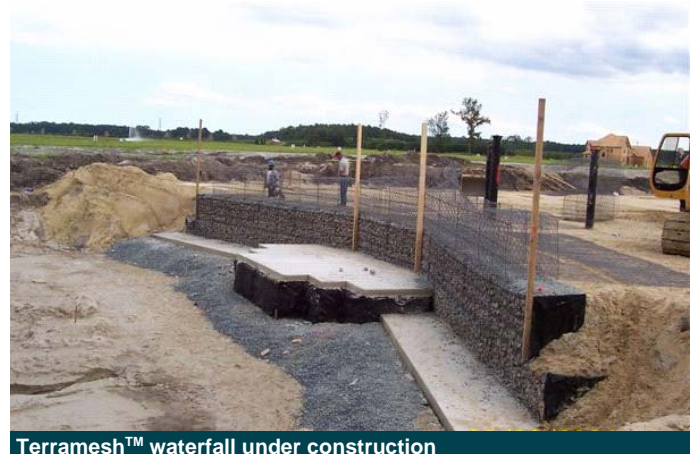
Terramesh™ waterfall under construction