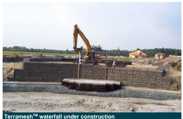
Terramesh™ waterfall under construction