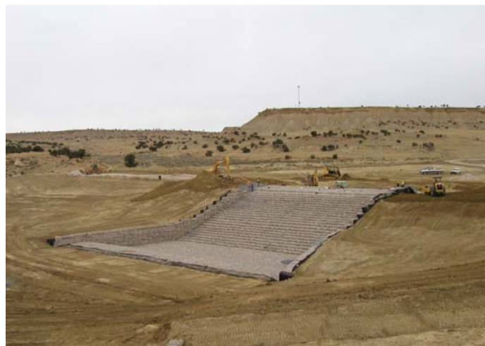
Construction nearing completion

This project clearly showed the erosive power of water. A large, robust structure was required to confine and control the high water flows, slowing them and reducing the damage they cause to the fragile soils in the area.