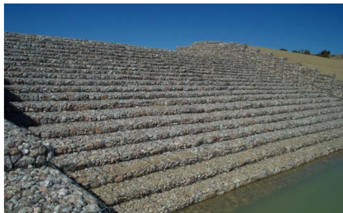
Completed dam after storm