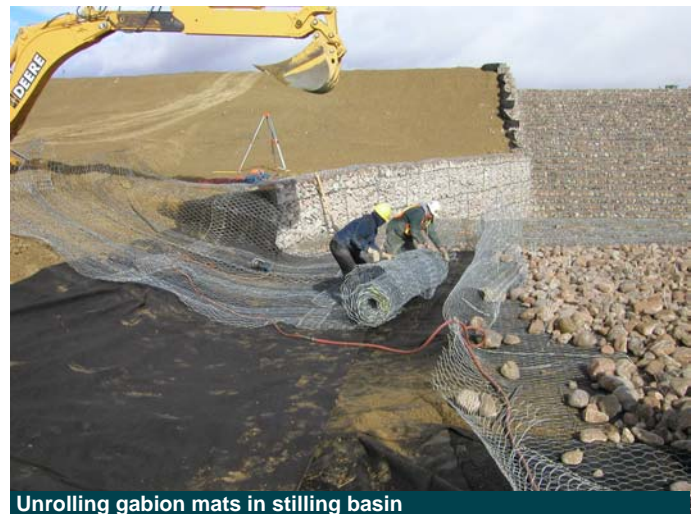
Unrolling gabion mats in stilling basin