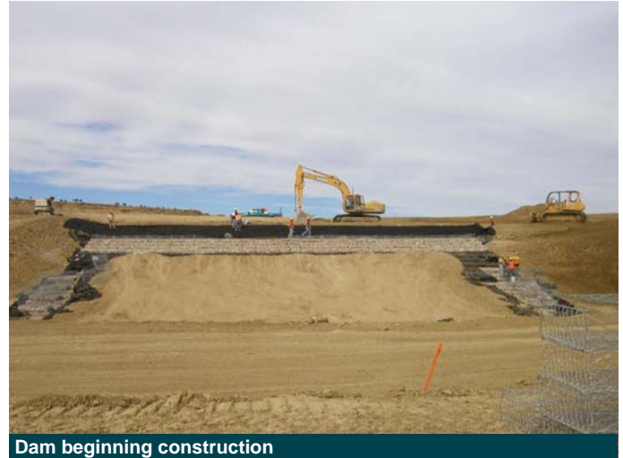
Dam beginning construction