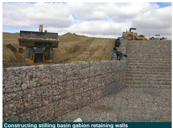
Constructing stilling basin gabion retaining walls