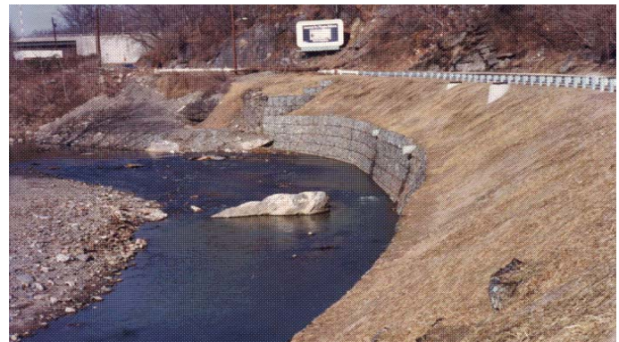
Completed structure 1974