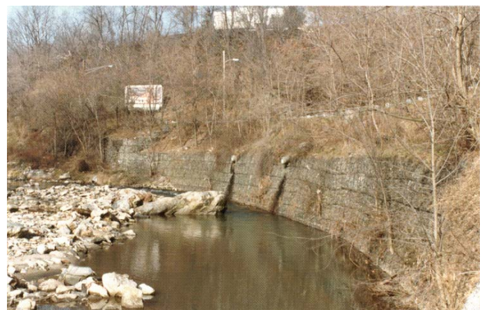
Completed structure 1985