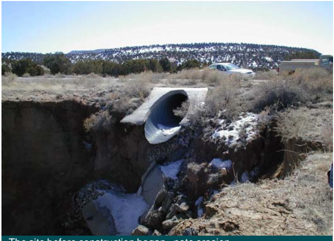
The site before construction began - note ero

The entire installation was constructed upon MacTex MX415 geotextile. This is important to limit fine soils from washing out from beneath the structure.