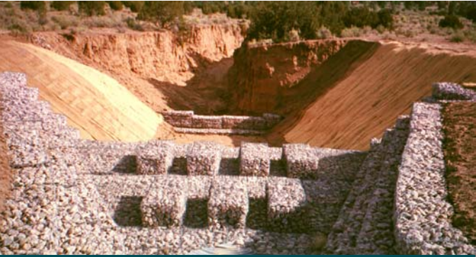
View towards gabion check dam

Headquarters - East Coast 10303 Governor Lane Blvd, Williamsport, MD, 21795 Tel.: (301) 223 6910 Fax: (301) 223 4356