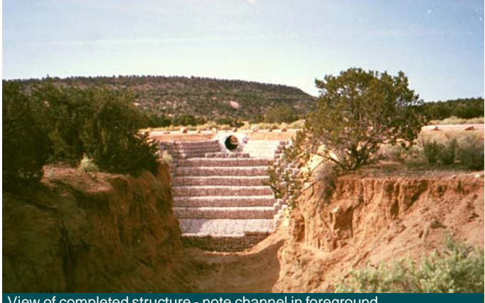
View of completed structure - note channel in foreground