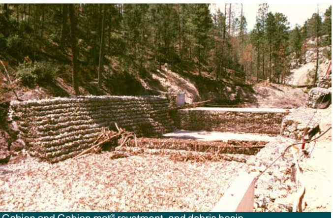
Gabion and Gabion mat® revetment, and debris basin