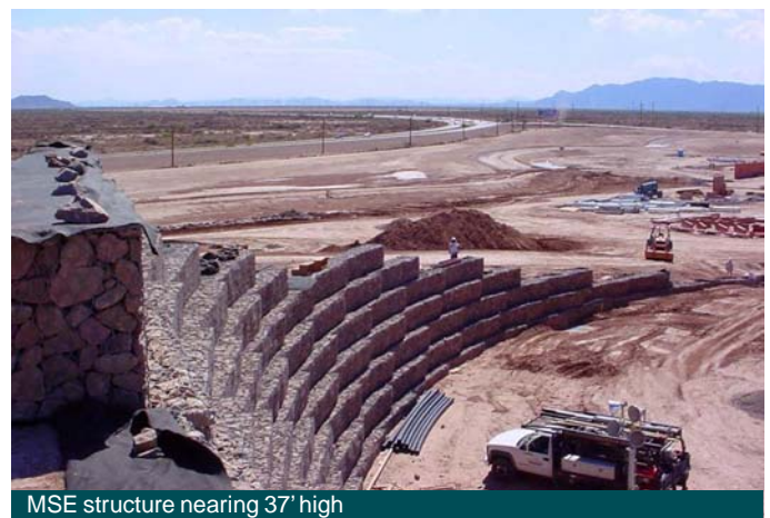
MSE structure nearing 37' high