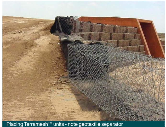
Placing Terramesh™ units - note geotextile separator