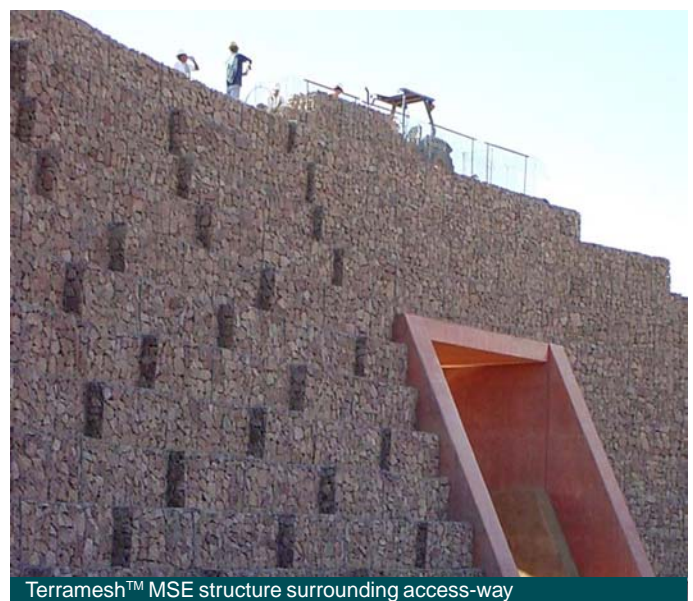
Terramesh™ MSE structure surrounding access-way