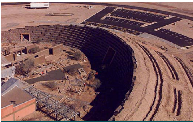
Construction nearing completion - from the air